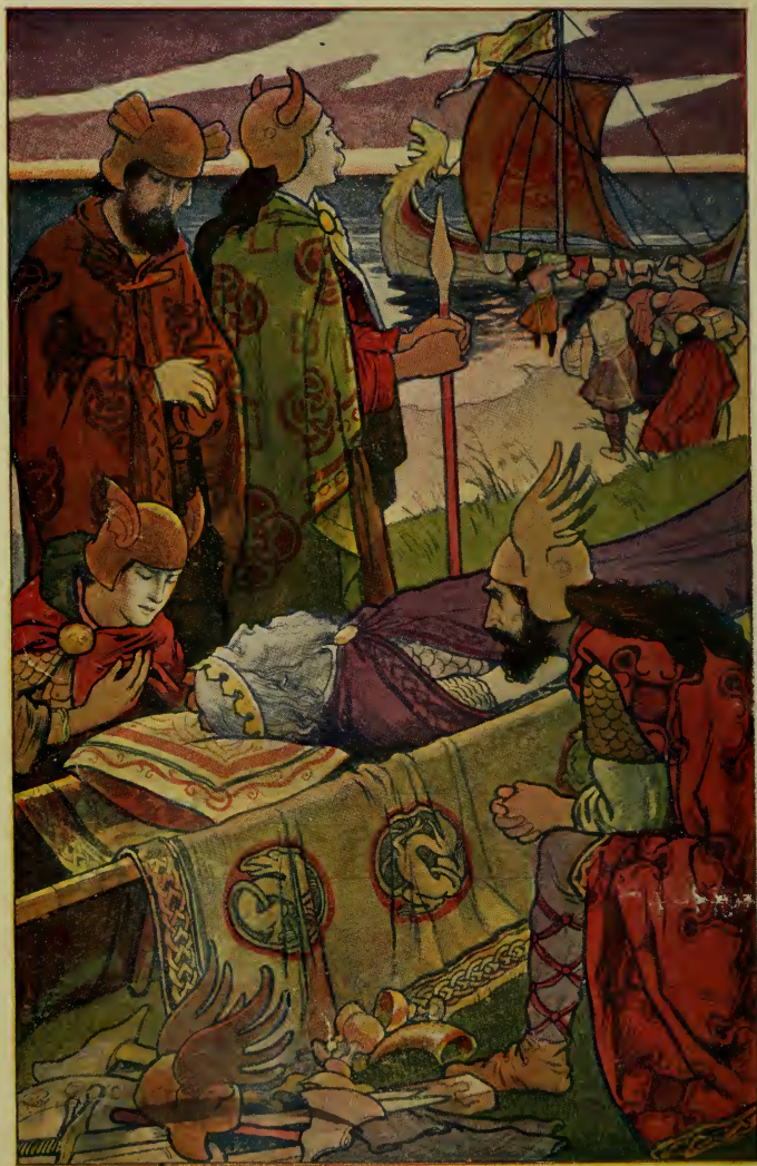
HOW THEY CARRIED SCYLD TO THE SHIP.